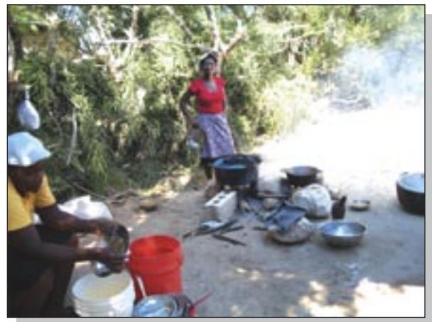
Food in Cabaret is prepared on the ground outside. People use local firewood for cooking as most of Haiti is now deforested.