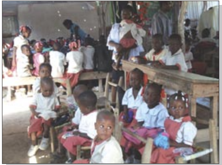
The two photos above are from the school in Cabaret. It is built from wood and plastic with a tin roof.