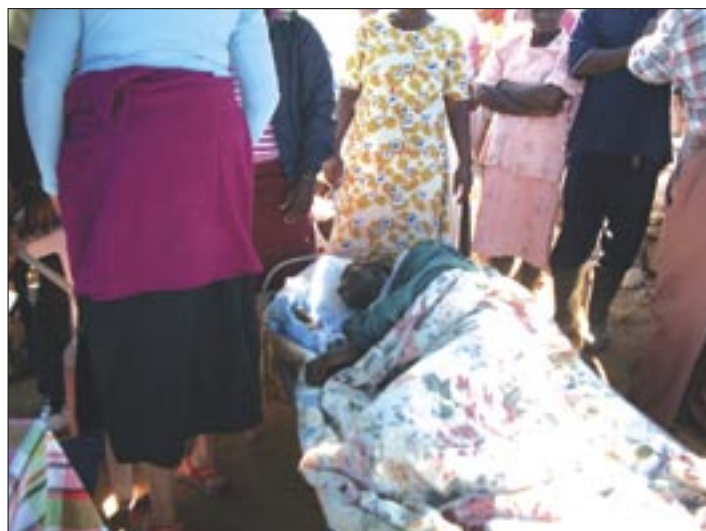
Haitians bring a woman in her bed to receive medical care. This reminds us of the passage in Mark 2:1-4, where four men in Capernaum brought a paralytic to Jesus through the roof of a building.