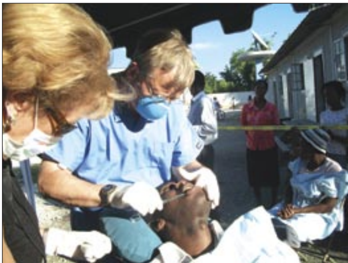
Dental care outdoors

The Day Spring team arrived on Saturday, November 14th in Port-au-Prince, and traveled to churches and schools to provide care. They also distributed notebooks, candy, and gift bags donated by Calvary Baptist Church. They stayed until November 20th, including one night spent in a tent in the mountains after a three-hour drive.