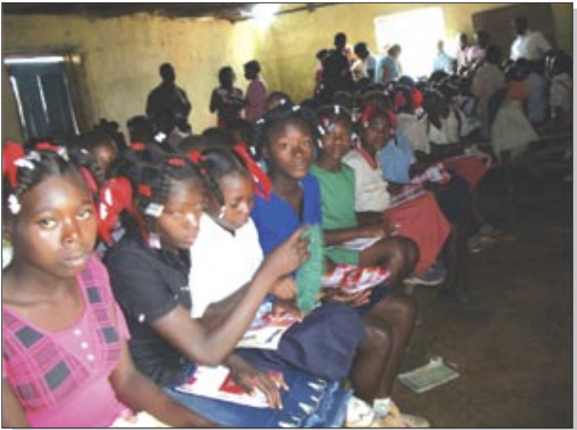
Students received new notebooks for school.