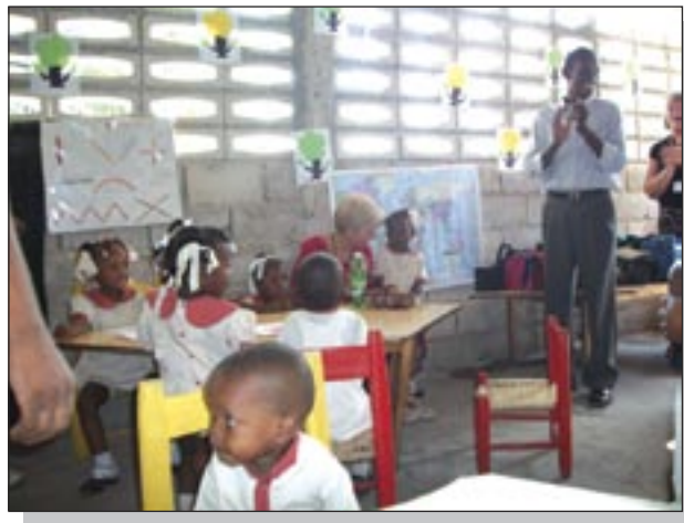
A school in Bon Repos, which is built of concrete.